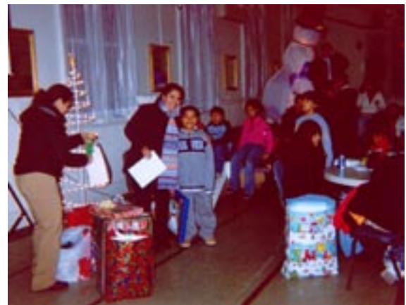
Members of the HIC Youth Program at the annual Christmas party.

Domestic Violence: The Center continues its affiliation with the Passaic County Women's Center. Persons with domestic violence situations can call or visit the counselor three days a week – Monday and Tuesday from 9:00 am – 5:00 pm and Thursday 2:00