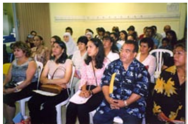
Father English Center Parents Teaching Parents English class

A world of colors is funded through the Department of Education and the Department of Human Services.