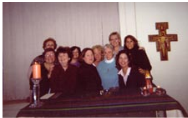
Congregational Health Ministry Health Parish Nursing Course graduates 2005

for 32 contact hours, the "Parish Nursing, A Basic Preparation Course" is the only course of its kind offered in New Jersey and continues to be well attended. To date, over 207 participants have completed the certification course. This course also provides a vehicle for nurses to come together for continuing education programs throughout the year. In January of 2004, St. Joseph's Wayne Hospital hosted a parish nursing continuing education program on End of Life Care, called Bridging the Gap. Clinicians from Passaic Valley Hospice, Totowa, and St. Joseph's Regional Medical Center, Paterson, as well as a local funeral director shared their expertise with parish nurses and others who work with parishioners at the end of their lives. In March 2004, 67 participants attended "Integrating Spiritual Care in Health Ministry