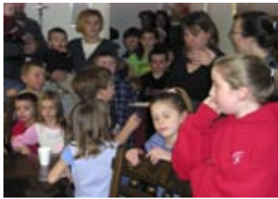
Clients of Paternership for Social Services Family Center in Franklin gather for the annual Christmas party.

health services. Services include individual and family therapy, and play therapy for children. Support groups and educational seminars are also provided throughout the year.