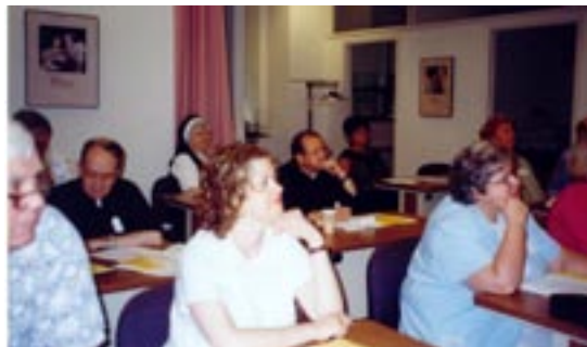
Disaster Preparedness Seminar August 2004 held at the College of St. Elizabeth

Each parish creates a ministry that is unique to its needs and resources. Overall, the presence of a health ministry builds community while bridging the gap between professional health care providers and local community resources. Recipients of these services often relate that the most important benefit is